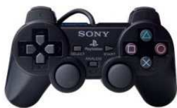
Dual Sony Shock 2 BD 2.500