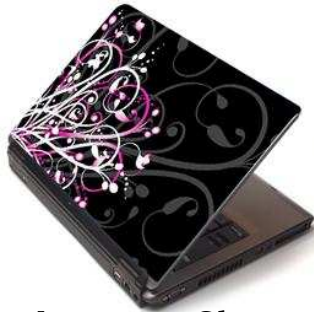
Laptop Skins BD 2.000