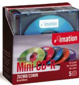
Mini CDR BD 1.500