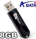
8GB 8GB Flash BD 8.000