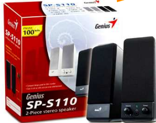
Speakers BD 2.000