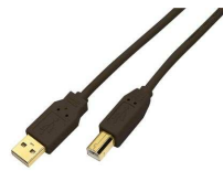
USB Cables BD 1.000