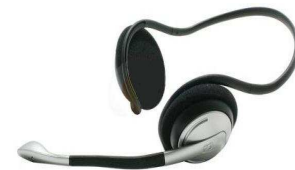
Head set BD 1.500