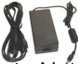
Laptop Adaptors BD 15.000