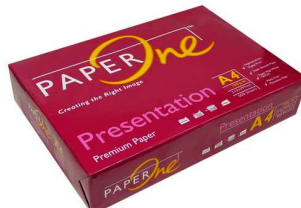
A4 Paper BD 1.500