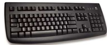
keyboard BD 2.500