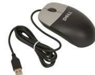
Mouse BD 2.500